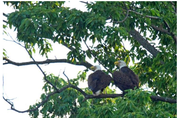
"George" and "Martha"